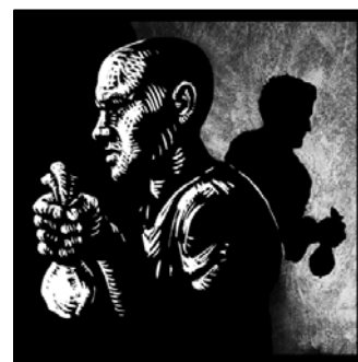
25th Sunday of Ordinary Time "Are you envious because I am generous?" Matthew 20:15

"The fragrance always remains on the hand that gives the rose." ~Gandhi