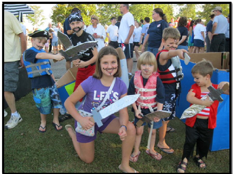
Our EYC & YPF had a blast at the 7 th Annual "Float Yer Boat" Cardboard Regatta!