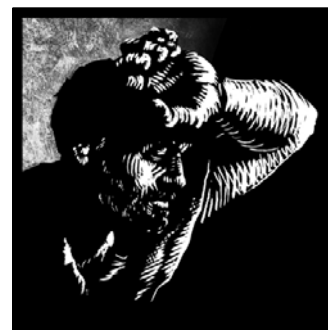
24th Sunday of Ordinary Time "Should you not have had pity on your fellow servant, as I had pity on you?" Matthew 18:33