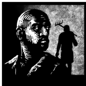
26th Sunday of Ordinary Time "Which of the two did the will of his father?" Matthew 21:31

Thursdays 7:00pm Choir Practice 7:00pm ALANON 7:00pm AA Group