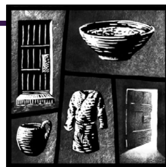
Christ the King "Amen, I say to you, whatever you did for one of the least brothers of mine, you did for me." Matthew 25:40