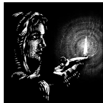
32nd Sunday in Ordinary Time "Therefore, stay awake, for you know neither the day nor the hour." Matthew 25:13