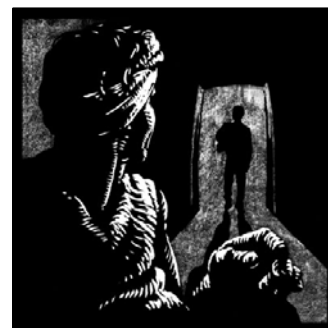
1st Sunday in Advent "Watch, therefore; you do not know when the lord of the house is coming." Mark 13:35