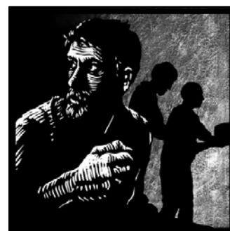
33rd Sunday in Ordinary Time "For to everyone who has, more will be given ... but from the one who has not, even what he has will be taken away." Matthew 25:29