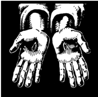
2nd Sunday of Easter "Peace be with you." John 20:19