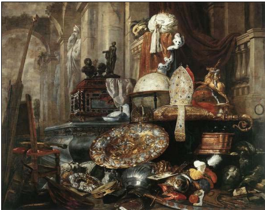
Vanitas Allegory, Pieter Boel, 1663