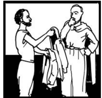
7th Sunday in Ordinary Time "If someone wants to go to law over your shirt, give him your coat as well." Matt 5:40