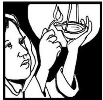
5th Sunday in Ordinary Time "Your light must shine before others." Matt 5:16