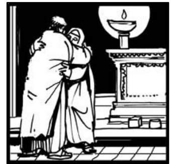
6th Sunday in Ordinary Time "Be reconciled first, and then bring your gift to the altar." Matt 5:24