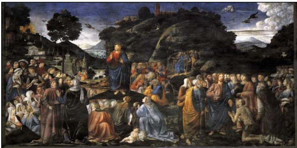
The Sermon on the Mount, Cosimo Rosselli, ca. 1482